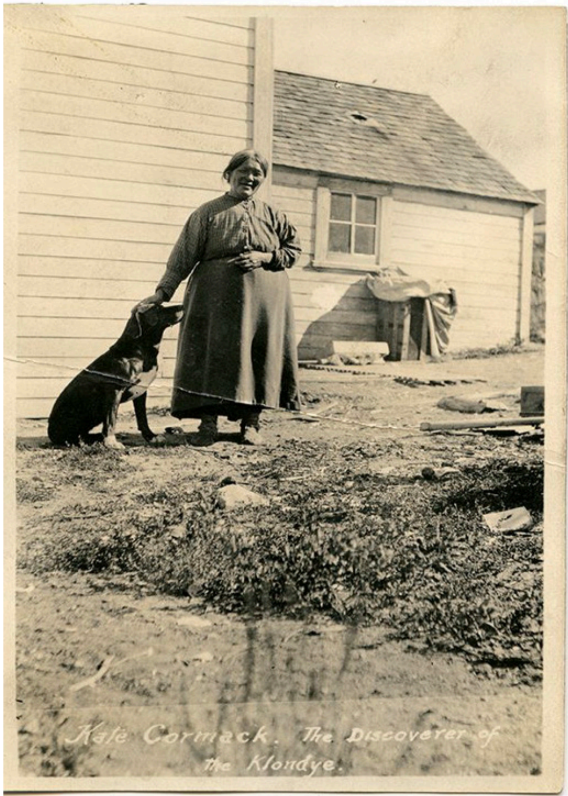
Photo Source: Kate Carmack. The Discoverer of the Klondye [Klondyke] . Circa 1918. Yukon Archives.

http://yukon.minisisinc.com/scripts/mwimain.dll/144/FIL/LIST/SISN%208556?SESSIONSEARCH